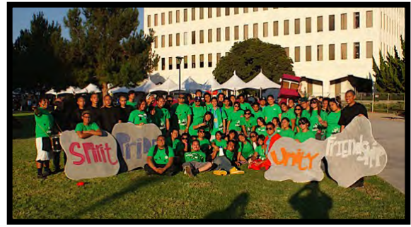
B-A-R-K-A-D-A WE ARE, B-A-R-K-A-D-A!!

off your SPUF (spirt, pride, unity, friendship) October 24 8am with Cal Poly Pomona's Barkada. It will be LEGEN... wait for it DARY!! 🏠